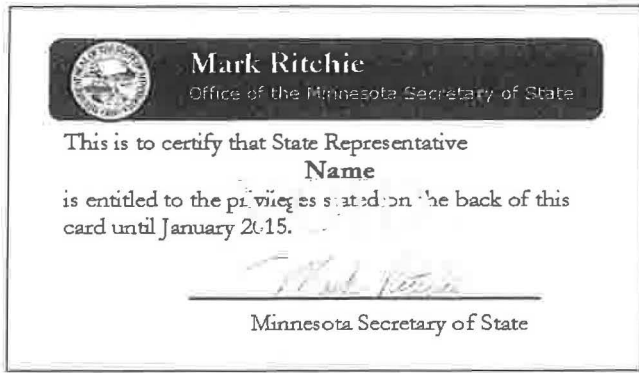
Front of legislative privilege from arrest card